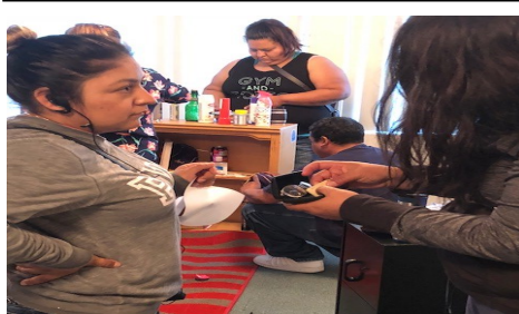
Hidden in Plain Sight attendees discover drug paraphernalia in the mock teenage room.